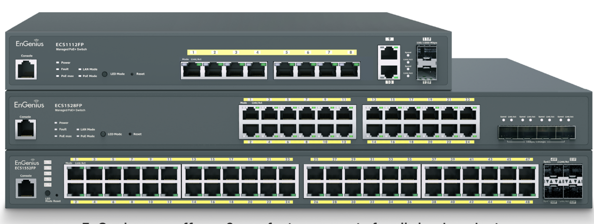
EnGenius now offers a 2 year factory waranty for all cloud products.